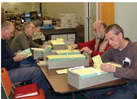
Canadian collectors pore through APS Sales Division circuit books during the April visit of the Greater Toronto Area Philatelic Alliance to the American Philatelic Center in Bellefonte, Pennsylvania.